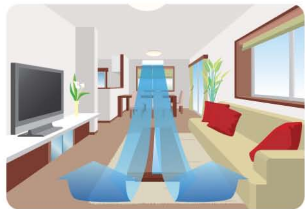
Increased air throw that reaches farther across the room