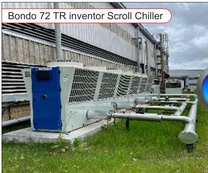
Bondo 72 TR inventor Scroll Chiller