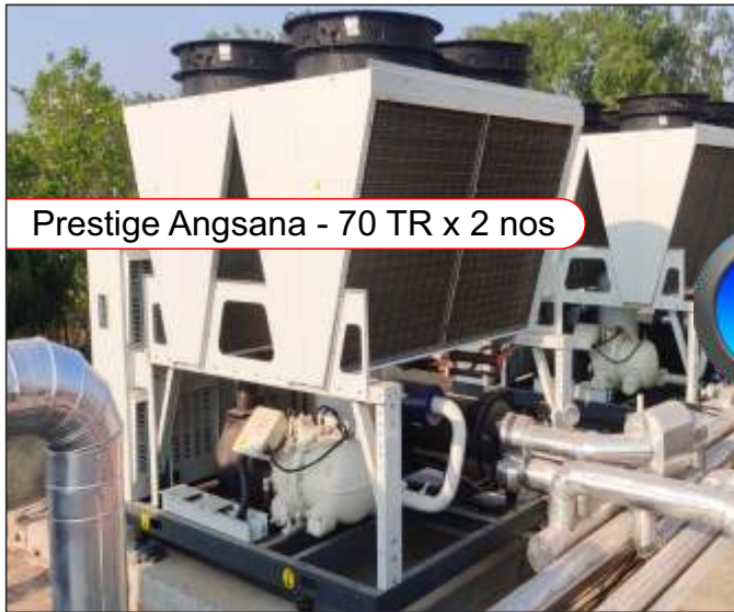
Prestige Angsana - 70 TR x 2 nos