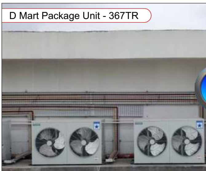
D Mart Package Unit - 367TR