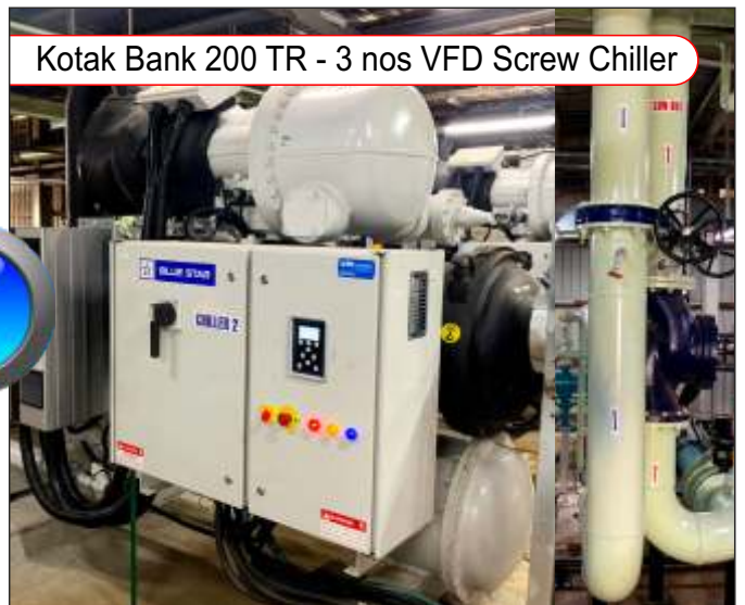
Kotak Bank 200 TR - 3 nos VFD Screw Chiller