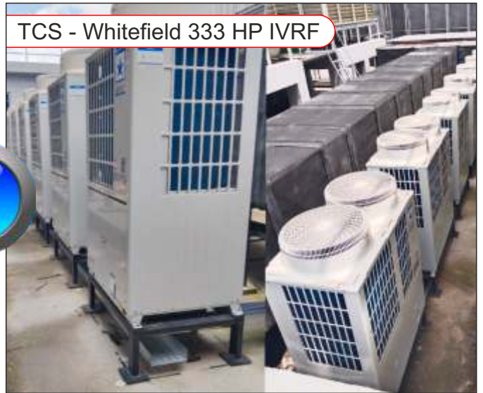
TCS - Whitefield 333 HP IVRF